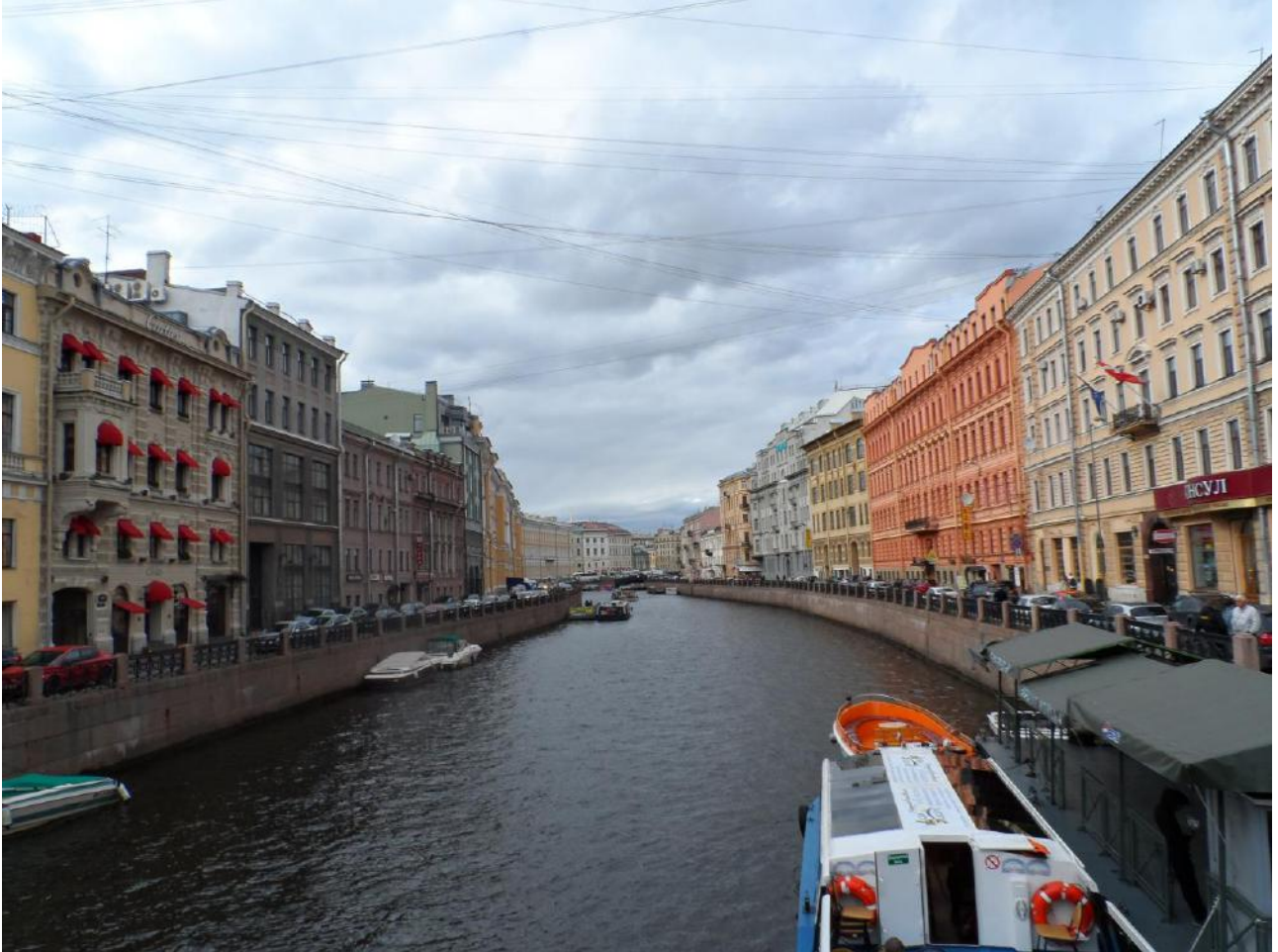
While in Saint-Petersburg seeing tour.